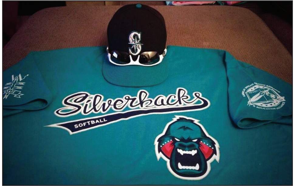
The Silverbacks Softball jersey and hat.

The CAICH Coug's, a coed team, also played in the Lawrence city softball league. The team was comprised of both community members and members of CAICH and AIHREA. Participating in this league allowed players to come out, be active, and have fun after a long day of work or school.