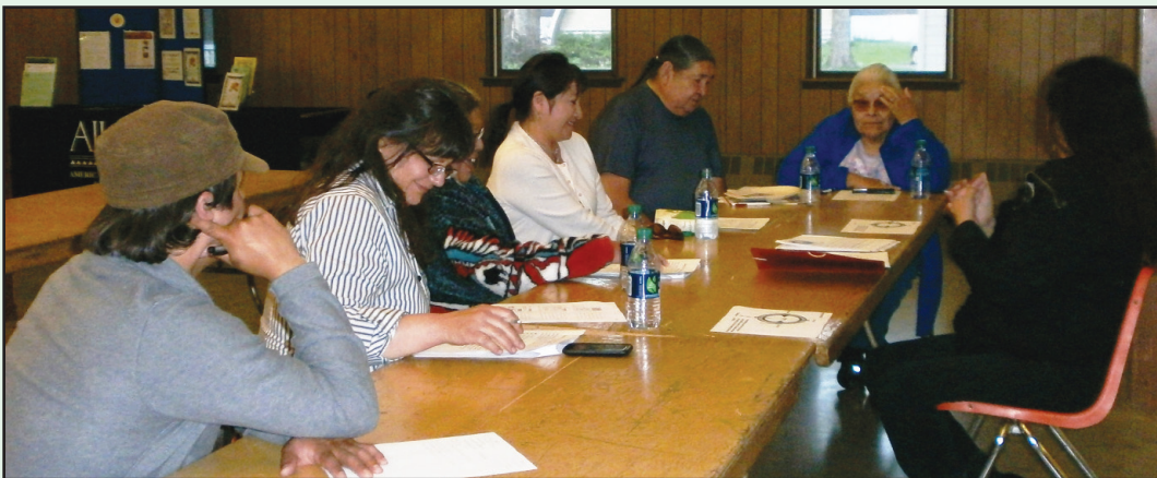
Left: Community members share cultural knowledge in efforts to improve health outcomes.