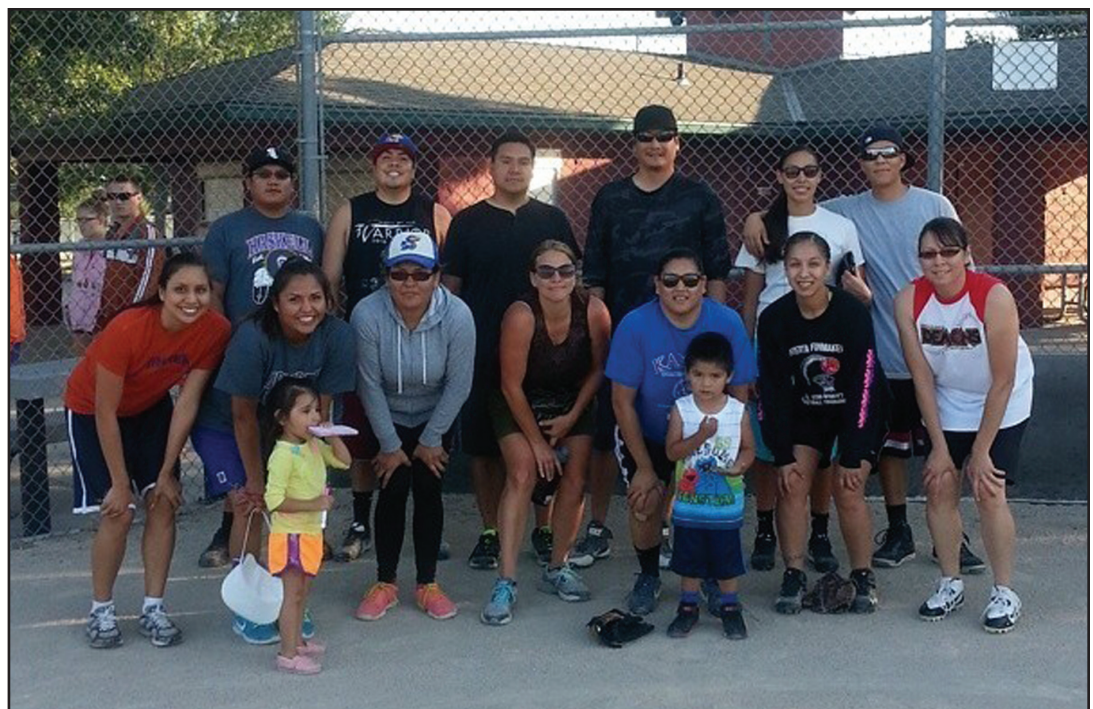
The CAICH Coug’s, a coed team.

This past summer, AIHREA found its passion for softball by sponsoring a number of